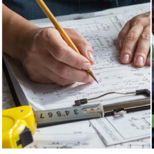
PRO parts Creating and delivering what you need to perform